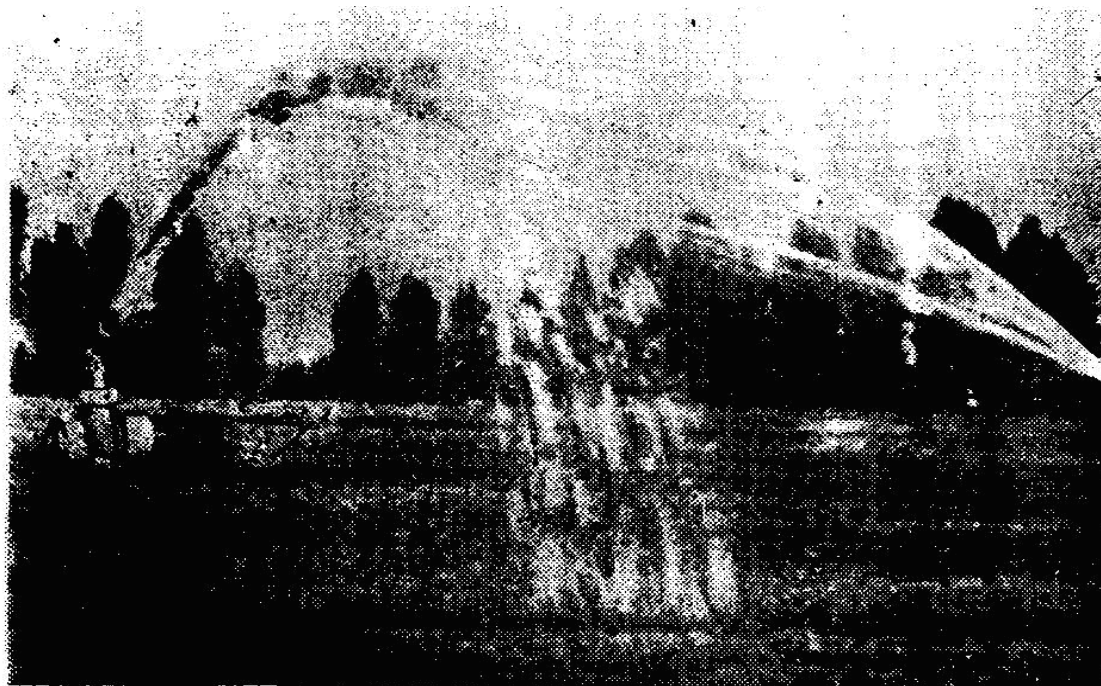
Fig.2 Demonstrations of the micro irrigation regime with the use of IDAH in conditions of irrigation of sugar beet, maize for power and soya in the Terter AIS of the Institute of "Agriculture".

Soaking of the soil during watering did not exceed 30-60 cm. Greater wetting and better uniform moisture distribution under these conditions is achieved with irrigation rates of more than 300-400 m 3 / ha. At such rates about 60-70% of water remains in the upper (20 cm) layer, and the plants are not completely supplied with moisture.